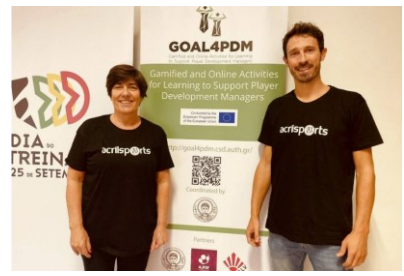
Portugal, September 2022 (CP & SJPF)

Each partner country -Portugal, Spain, Greece, Germany, Lithuania, Cyprus, Italy- hosted the first Multiplier Sport Event (MSE). MSE I was a hybrid workshop that communicated project objectives to target groups (students, athletes, coaches) and collected essential information about target groups' required skills and educational needs to become effective PDMs.