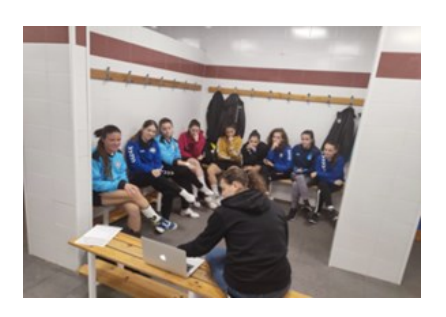
Spain, October 2022 (AJFSF)